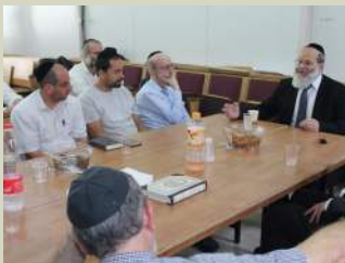
Friday morning PARSHA SHIUR live with the Rav