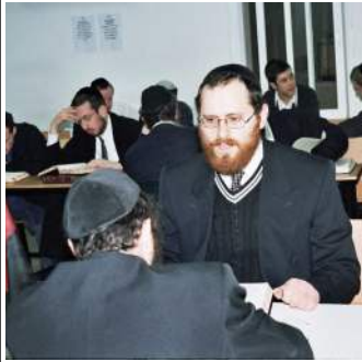
In the Beis Medrash 5763