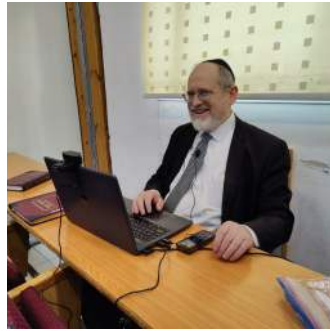
In the Beis Medrash 5784